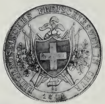
Lot No. 3361

GRAUBUNDEN. Shooting Taler (4 Franken), 1842. Chur. Obv. Three shields held by hands extending from clouds. Rv. Swiss Arms on crossed rifles. Dav.372, KM 1. One of only two Shooting Talers issued prior to Confederation. Light gray toning. Nice Extremely Fine. (900–1,200)